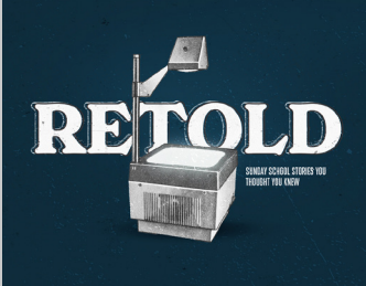
Series <u>study guide here</u> or at the Welcome Desk.